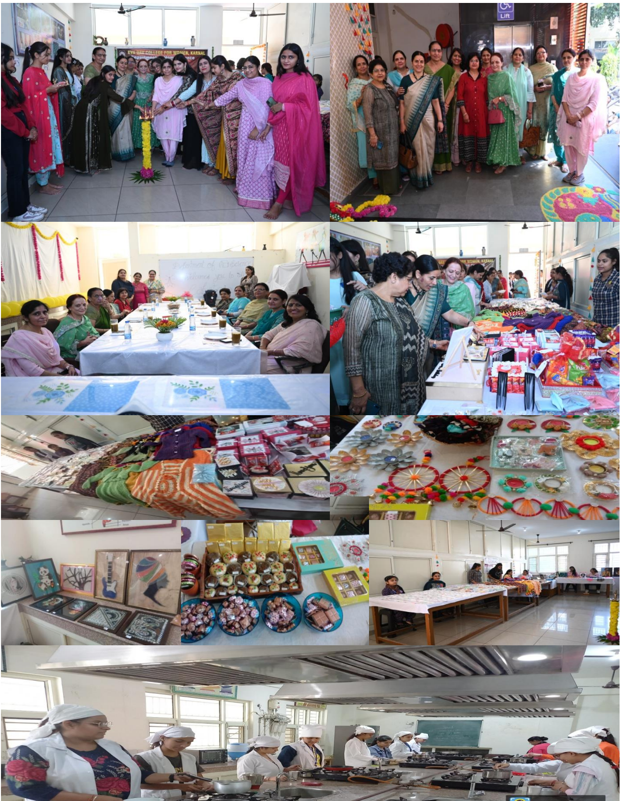
Exhibition cum Sale & Cafeteria from October 19-20, 2022 on the auspicious occasion of Diwali.