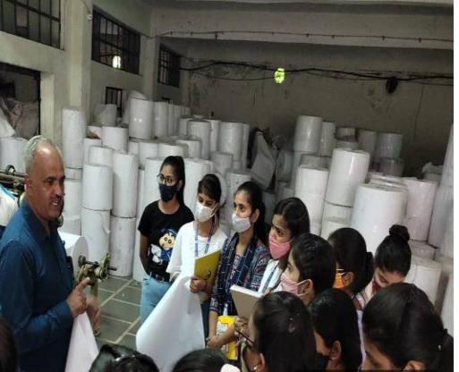
One day Industrial visit for the students of B.Sc. Fashion Designing and B.Voc Fashion Technology at Gayatri khadi, Karnal Yadav Knits, Karnal and Rahul Trading Company, Karnal on October 8, 2022.