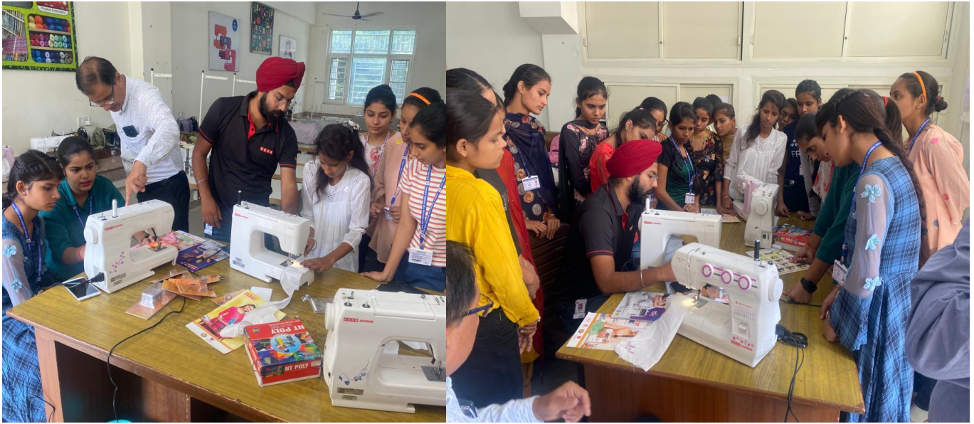
Stitch and Style workshop by Usha Company, Jalandhar, Punjab on October 11,2022.