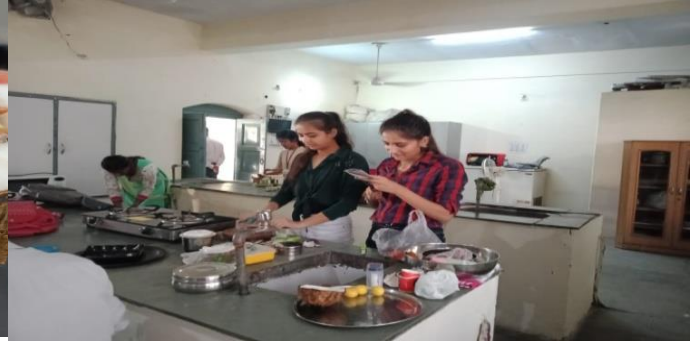
District level salad making and salad decoration competition held on 28 September, 2022 by Government College for Women, Karnal.