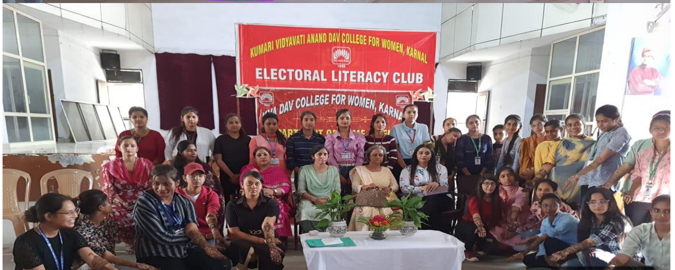
District Level Rangoli and Mehandi Competition on October 28, 2022.