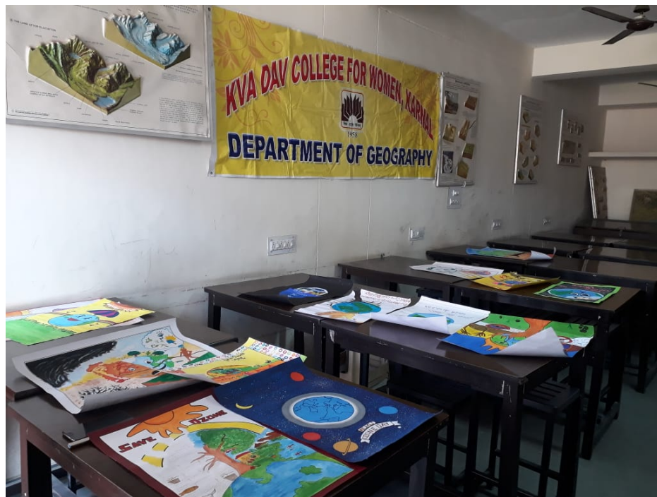
Posters of students during the Poster Making Competition on Ozone Day on September 16, 2019