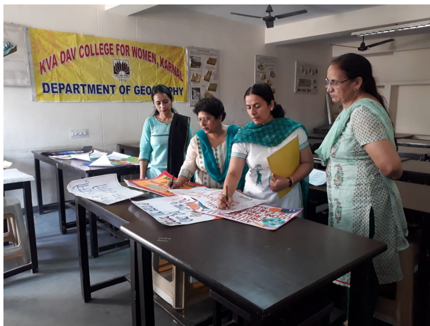
Judges judging the Slogans during Slogan Writing Competition