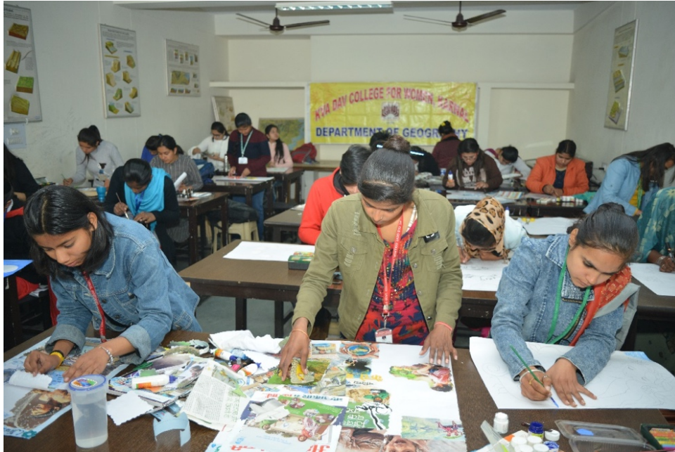
Students participating in the Collage Making and Painting Competition during Indradhanush held on February 26, 2020