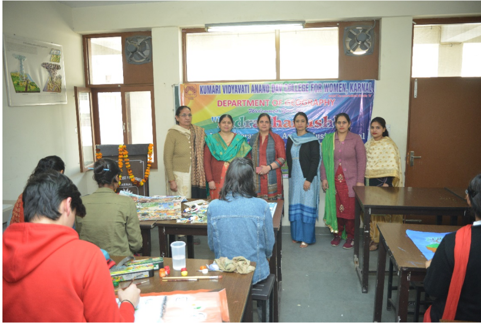
Judges with faculty of Department of Geography during Indradhanush held on February 26, 2020