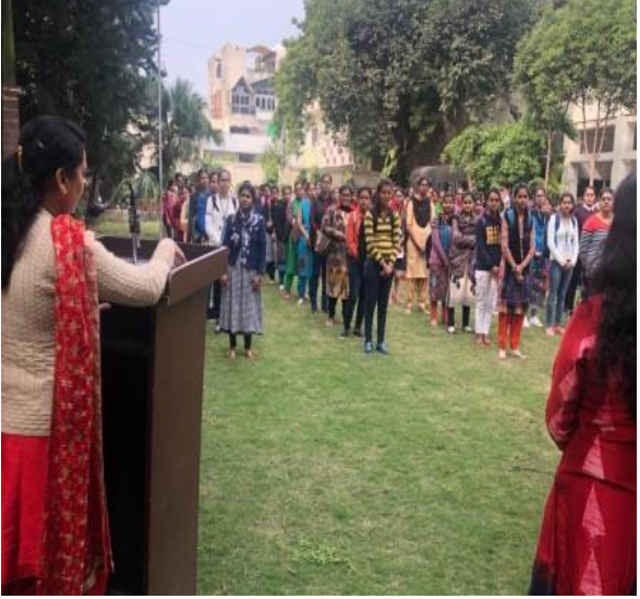
Students reading the Preamble on Constitution Day with Principal Madam and Teachers