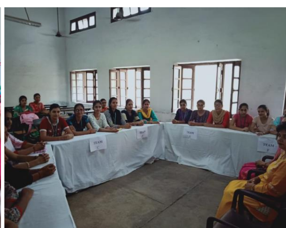
Participants of Quiz Competition with Teachers