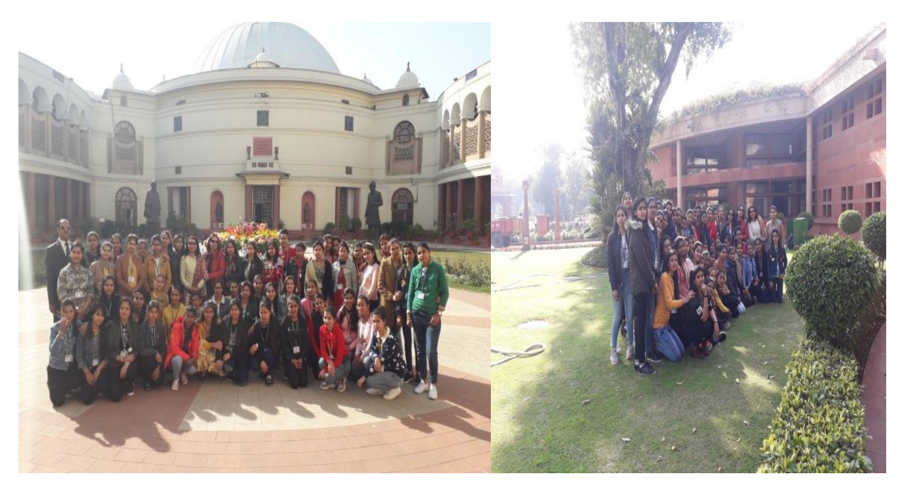
Students infront of Central Hall, Parliament House