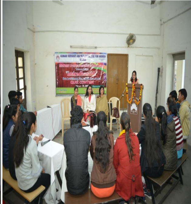
Teachers taking screening test in Quiz Contest