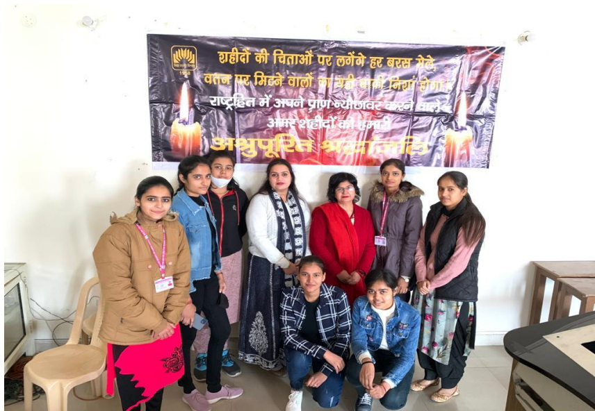
Students and the faculty of History department