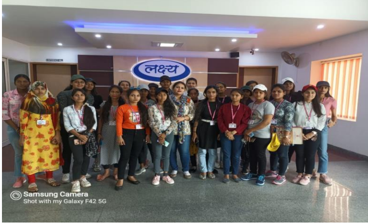
Visit to Lakshya Milk Plant