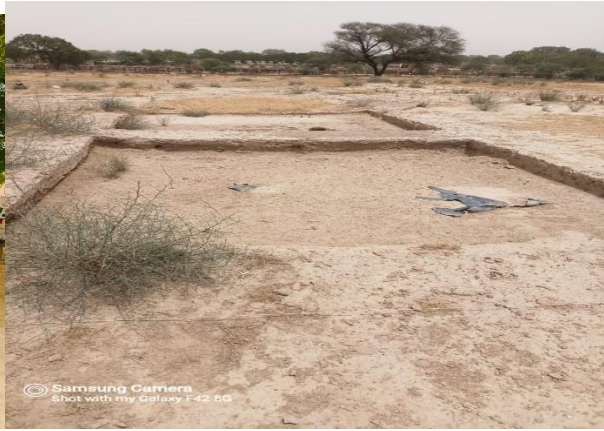
Sites of Rakhigarhi village students along with the faculty members